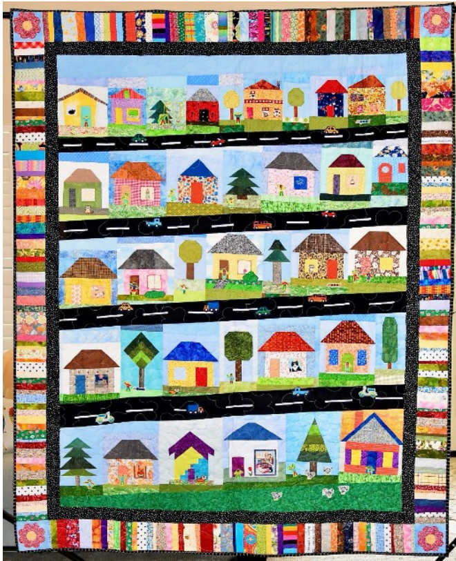
House Opp Quilt