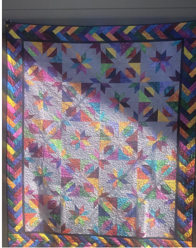
Displayed on National Quilt Day by Denise, March 20, 2021