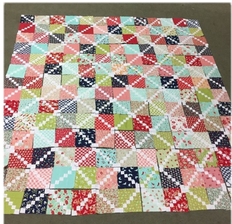
The next opportunity quilt is coming along.