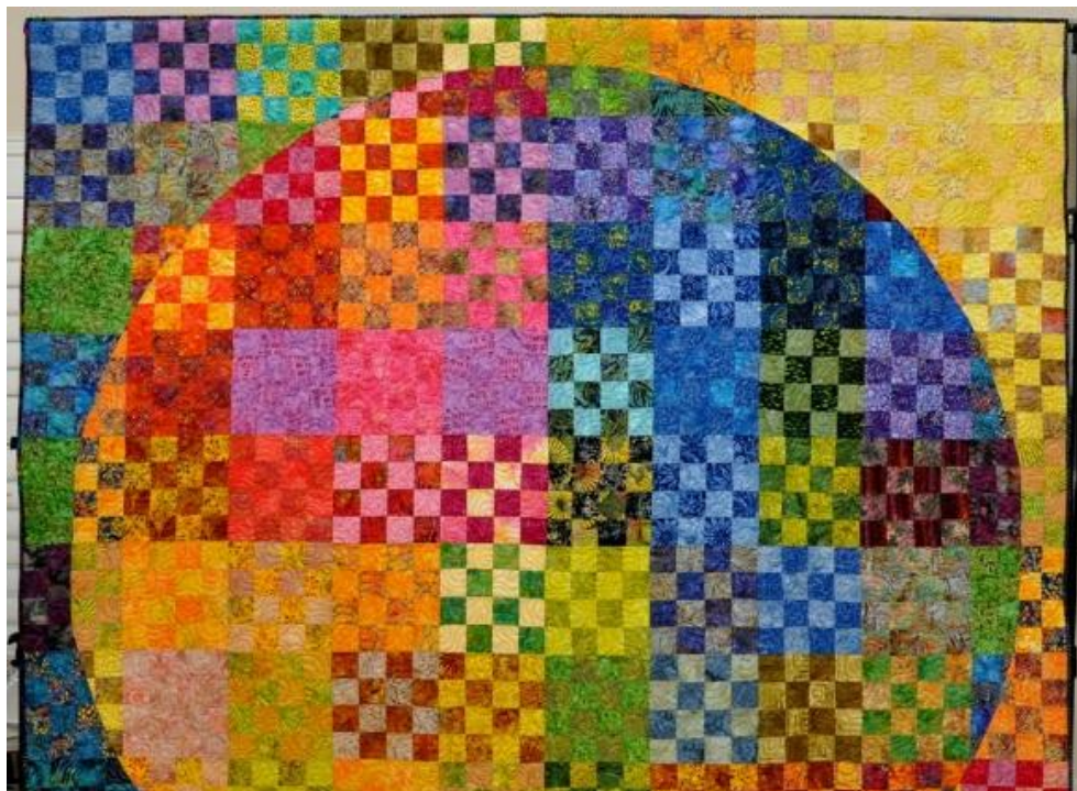
WIN THIS QUILT